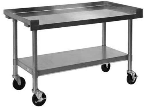
Medium Duty Cookline Stand