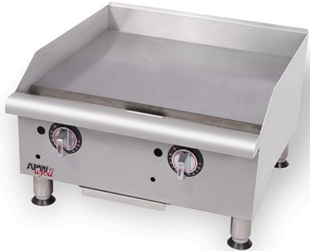
Model GGM-24i Gas Manual Griddle