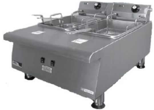
Model HEF-30Ti Heavy Duty Electric Fryer