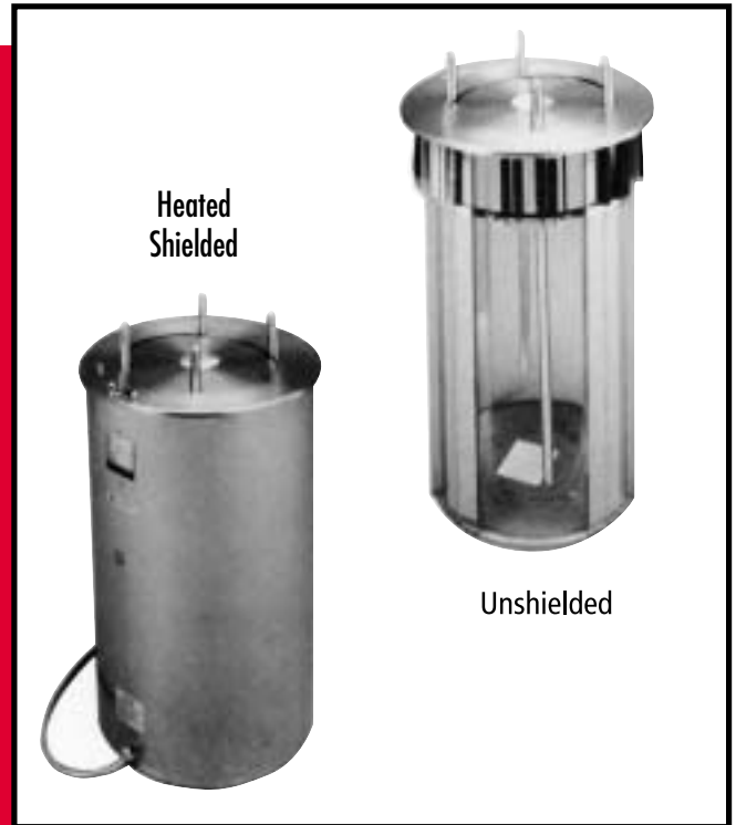
Oval Dish Dispenser