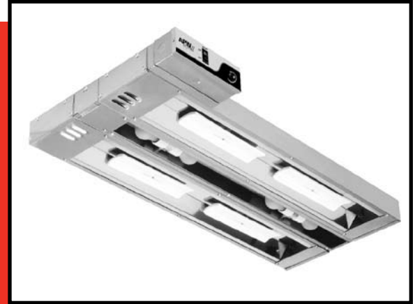
C*RADIANT™ DOUBLE OVERHEAD WARMERS