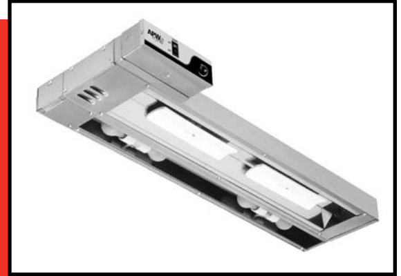
C*RADIANT™ LIGHTED SINGLE OVERHEAD