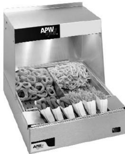
Model: Countertop Fry Holding Station CFHS-21