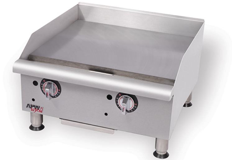
Model GGM-24i Gas Manual Griddle