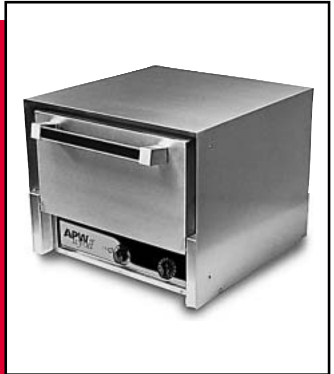
Counter Deck Oven