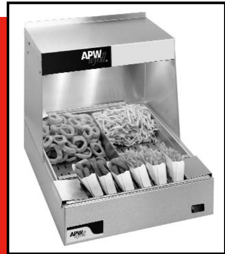
Countertop Fry Holding Station CFHS-21