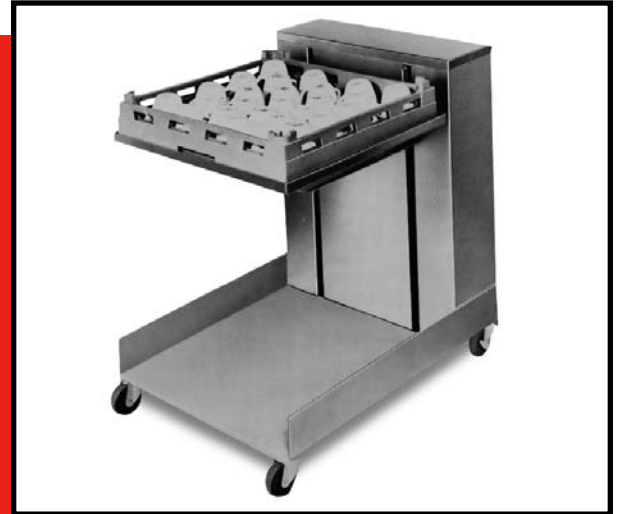
Cantilever Glass & Tray Mobile Dispenser