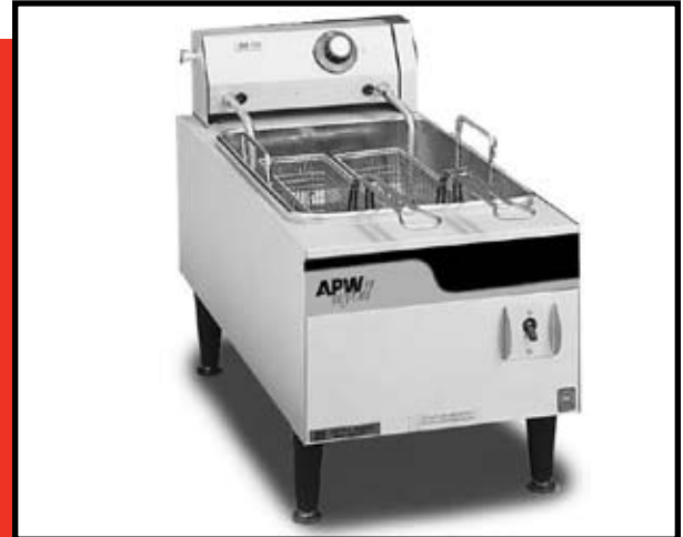
EF-15N Countertop Electric Fryer