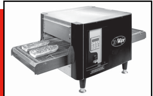
X*WAV1422-EZ® Pass-Through Conveyor Oven