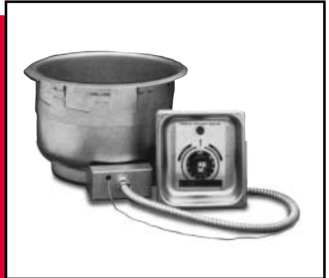
MODEL SM-50-11D UL HOT FOOD WELL