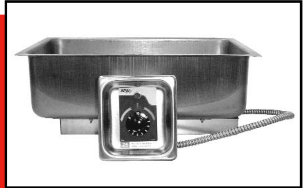
Uninsulated Bottom Mount Hot Food Well BM-30-UL