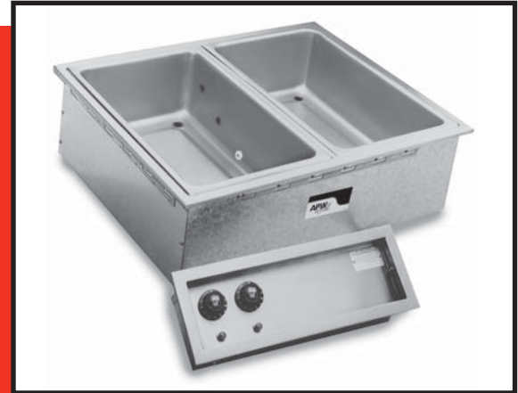
EZ-Fill Top Mount Hot Food Well